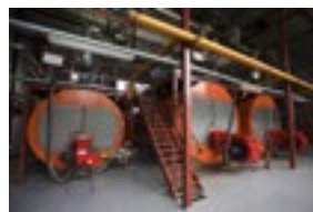
Boilers & Process Heat