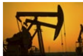
Oil & Gas, Geothermal