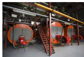
Boilers & Process Heat